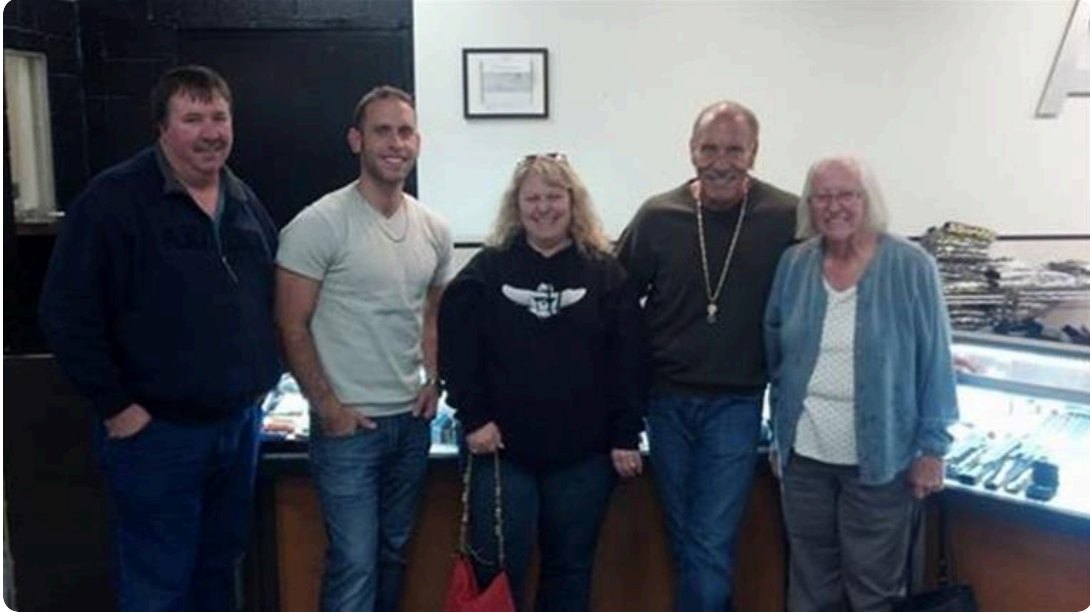
Hardcore Pawn cast.